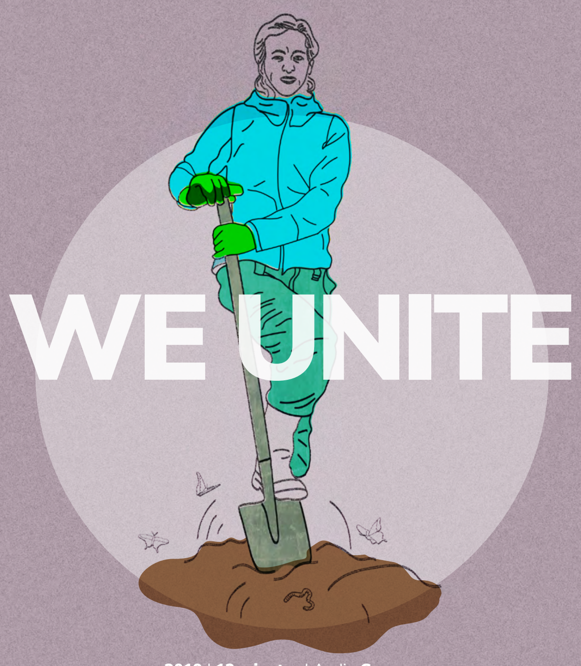
2019 | 12 minutes | Audio German Subtitles in Czech, Dutch, English, French, German, Greek, Italian, Lithuanian, Polish, Portuguese, Romanian, Slovenian

Initiated by IFOAM - Organics International, this is a Common Table Creative film and an iCoolKid Production.